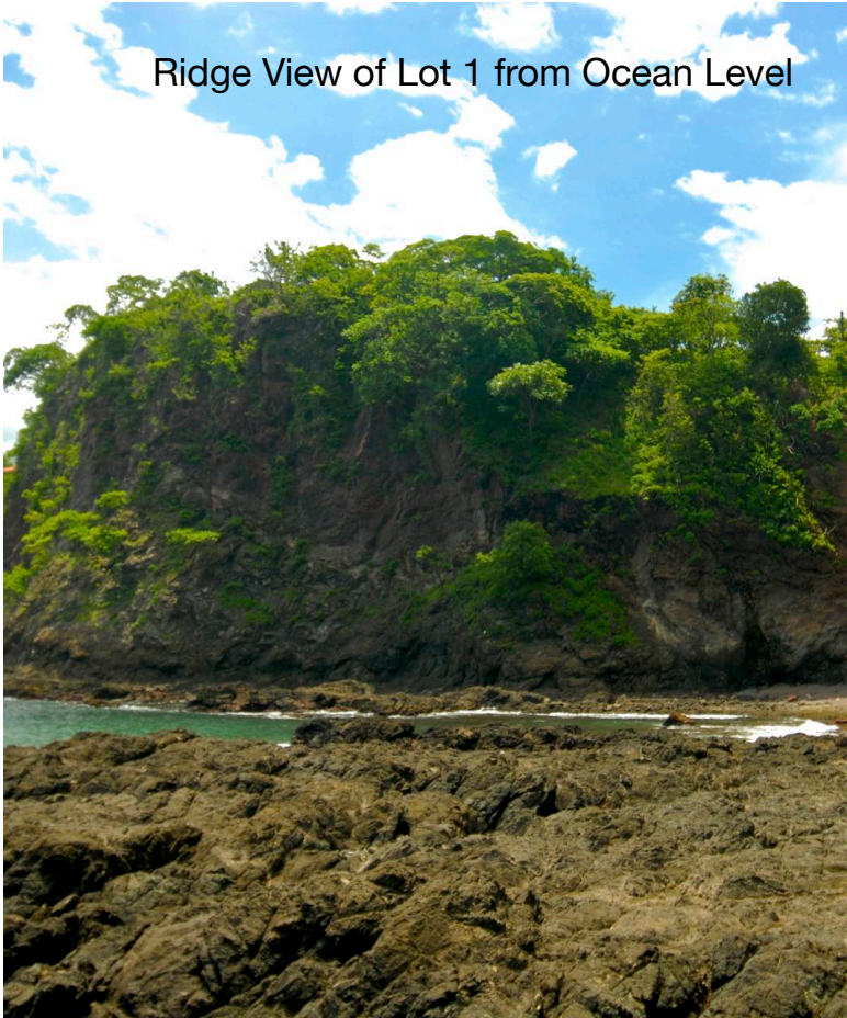
Ridge View of Lot 1 from Ocean Level